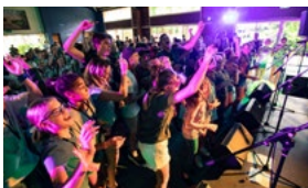
KIDS & YOUTH

Sundays during Term 1 Catch up on messages and download the Life Group book online