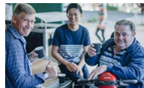
MEN & WOMEN

Join us for our Easter services Good Friday 19th & Easter Sunday 21st April