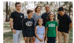
MARRIAGE & FAMILY